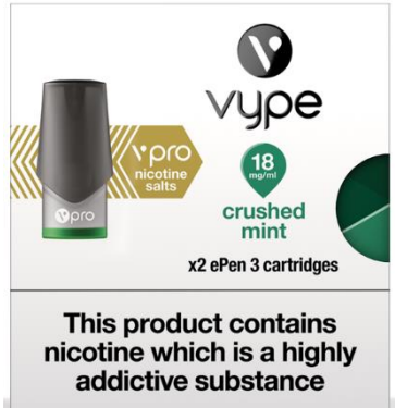
European Union (United Kingdom)