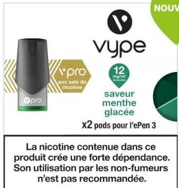
European Union (France)