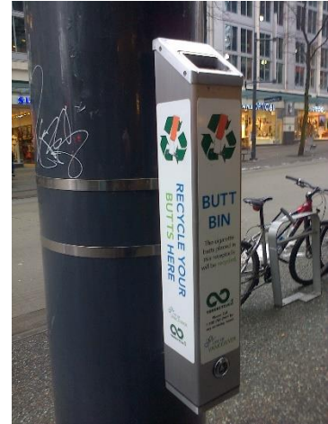
Vancouver’s partnership with Imperial Tobacco-funded butt recycling program was criticized as being inconsistent with health objectives. The pilot program was subsequently dropped.

Canadian governments are bound by the Framework Convention on Tobacco Control, which provides guidance on how to protect public health from commercial and other vested interests. 80 Partnerships with tobacco companies in providing public ashtrays – as implemented in some communities and proposed by the B.C. Ministry of Municipal Affairs and Housing in 2018 81 – are likely not consistent with this article of the FCTC.