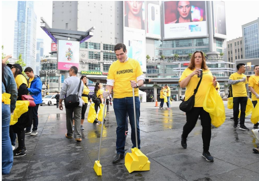
Rothmans, Benson & Hedges employee clean-up, Toronto, 2019.

BAT acknowledges that cigarette filters provide a waste issue for regulators. However, it believes that the most appropriate solution is promoting the proper disposal of butts so that they don't pollute the environment.