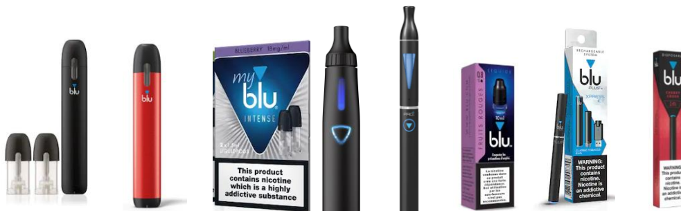
Table 1: Availability and prices of BLU vaping devices and liquids – local currency (Prices as stated on the blu web-site, unless indicated otherwise)